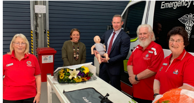
Avalyn is a CPR and choking rescue training mannequin who's found a new home at the Queensland Ambulance Service (QAS) Springwood Station.

This wonderful group of local volunteers runs our local Logan and Districts Local Ambulance Committee and helps with fundraising and CPR awareness sessions.