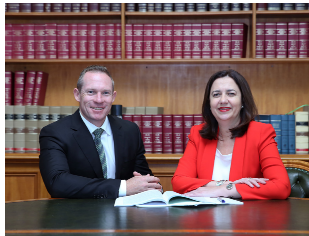
Supporting Queenslanders' Mental Health

This global pandemic isn't just claiming lives directly from the virus - it is taking a massive toll on Queenslanders' mental health. It is placing an enormous strain on many families. We are seeing more of our elderly become more and more isolated and more and more vulnerable. My government will provide an additional $46.5 million for localised mental health community treatment and support services. We want to provide the support so Queenslanders can make it through this. The endless coverage of what is happening in other parts of Australia and around the world is taking a toll on all of us. It is simply heartbreaking to watch. And we need to all be looking out for each other” - Premier Anastacia Palaszczuk MP