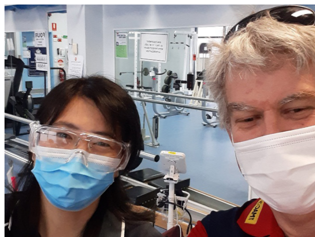
“They saved my life”

“In late May, 2020 I was visiting my local GP for a medical check up when I realised my heart rate was racing. An ambulance was called and I was taken to Logan Hospital. The decision saved my life as I was in a cute atrial fibrillation.