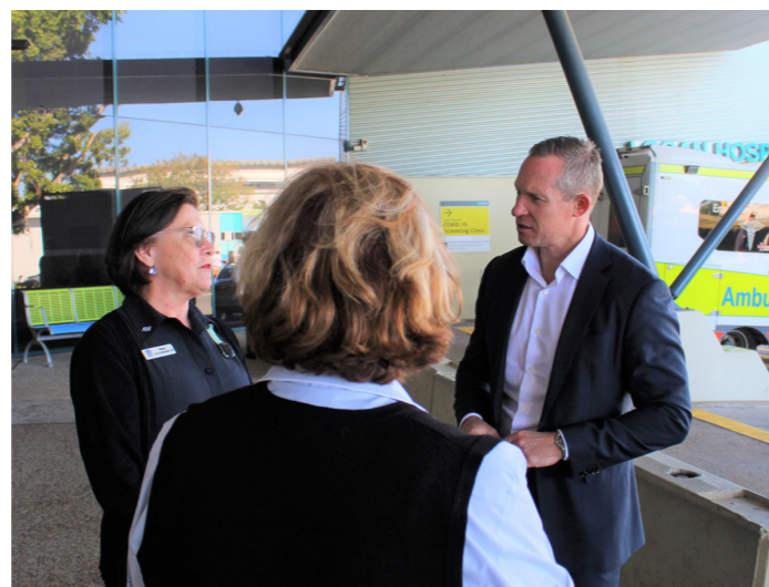
More doctors and nurses for your family - when you need them