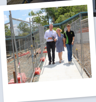
Every child deserves a quality school, and the new accessibility upgrades at Springwood Central make sure of that.

“I am proud to be a part of such a wonderful school. It has been great to see the strength and resilience of the students, and the teachers through the pandemic crisis.