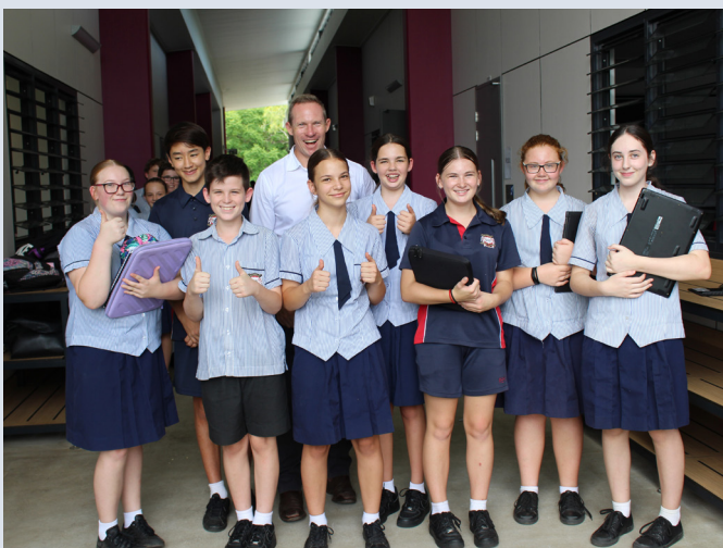
New buildings at Rosedale SHS were constructed for the first year of Prep students entering grade 12, with the project supporting local jobs.