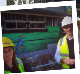
This project is providing first class facilities for local students, and has supported 239 local jobs for tradies.

“The Performing Arts Centre is at the heart of every school. It’s where the school holds parades, graduations, dances and performances.